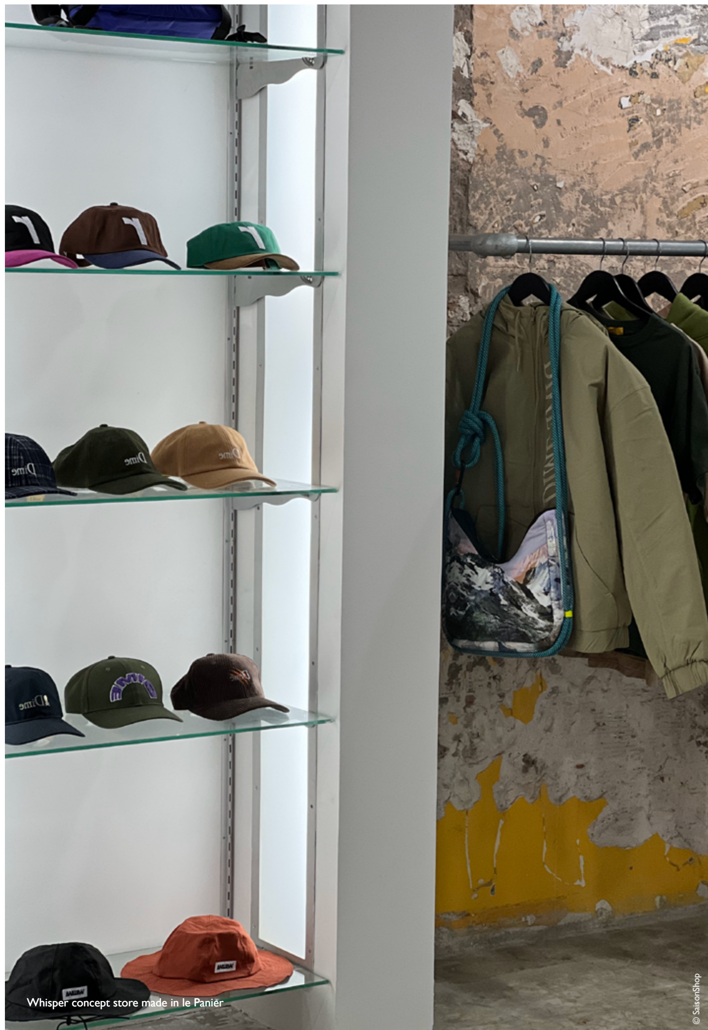
Whisper concept store made in le Panier

Okjö // Welcoming, eco-friendly boutique dedicated to the zero-waste universe. The ideal address to fill up on great products that are good for the planet! www.okjo-marseille.com