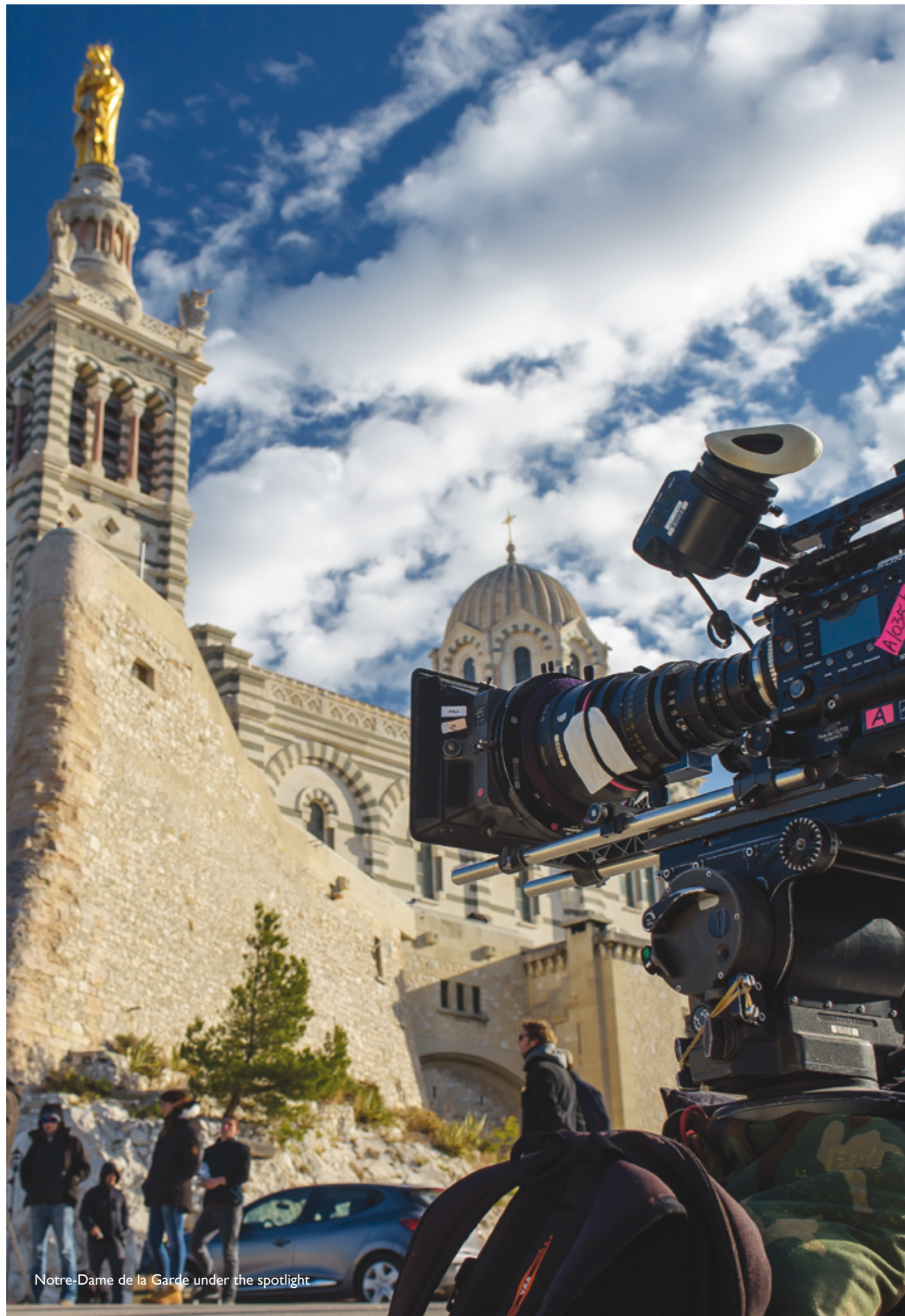
Notre-Dame de la Garde under the spotlight

Marseille has advantages that no one else has: a singular photogenic nature, an unmatched musicality, and breathtaking light. From the outset, auteurs, screenwriters, and directors have been inspired by the streets of this Phocaean city , by the Vieux-Port, and also its exceptional natural scenery. From the dizzying cliffs in the Provençal hills to the Frioul islands, everything is here!